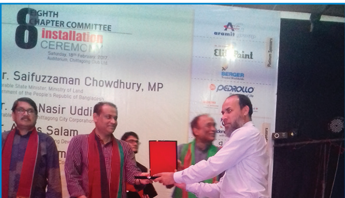
Pedrollo participated at the Architect Forum ceremony