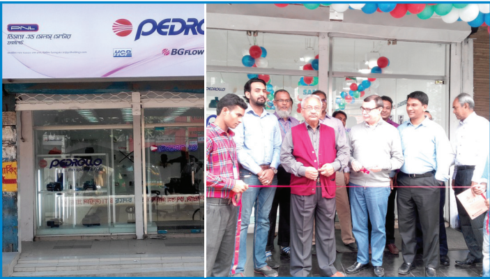
New showroom opens at Farmgate