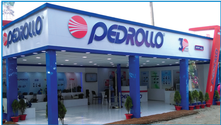
Pedrollo at Dhaka International Trade Fair 2017