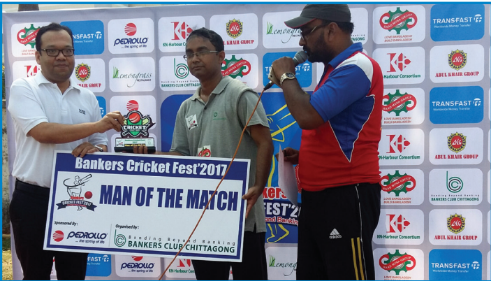
Pedrollo sponsored a Cricket tournament by Bankers