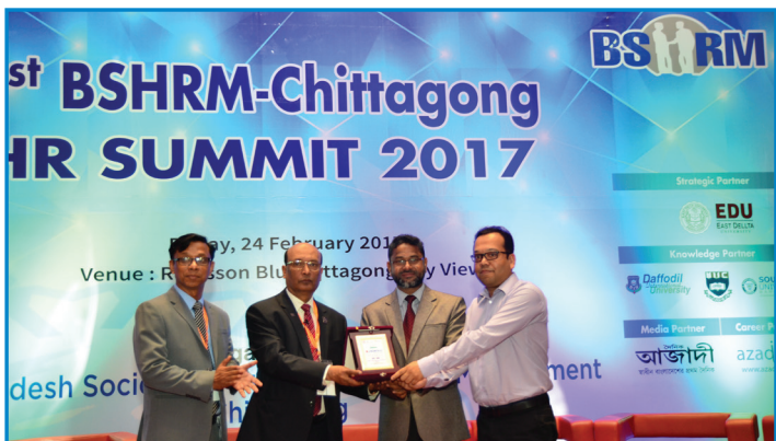
Pedrollo received recognition from Bangladesh Human Resource Management