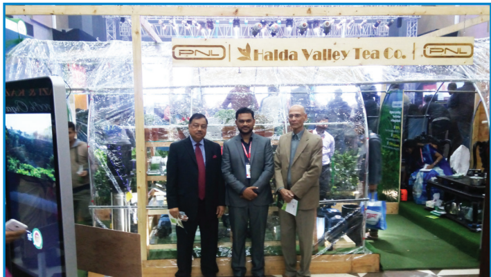
Halda Valley participated in Tea Expo 2017