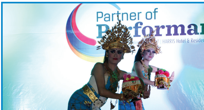
Local artists performing in a pleasant cultural event