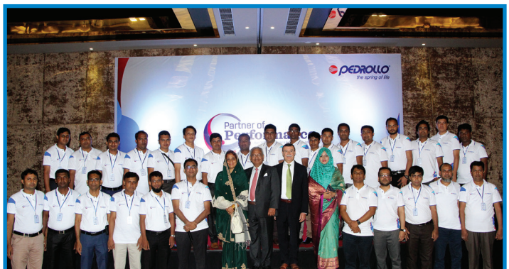
Officials with the Managing Director of Pedrollo nk Limited