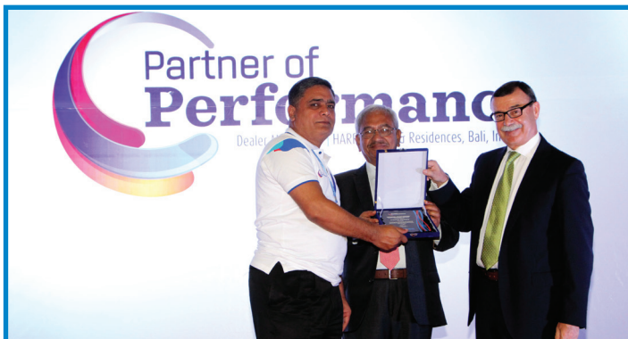
Awarding prize to the best distributors of the country

Distributors were also rewarded in several categories in the conference. At the end, the cultural functions of the Indonesian artists won the viewers' attention and the program ended up with a Gala dinner. The distributors were taken to the tourism of several tourist attractions of Bali, where they were amazed with the golden sand of the beach, the pleasant climate and the warm hospitality.