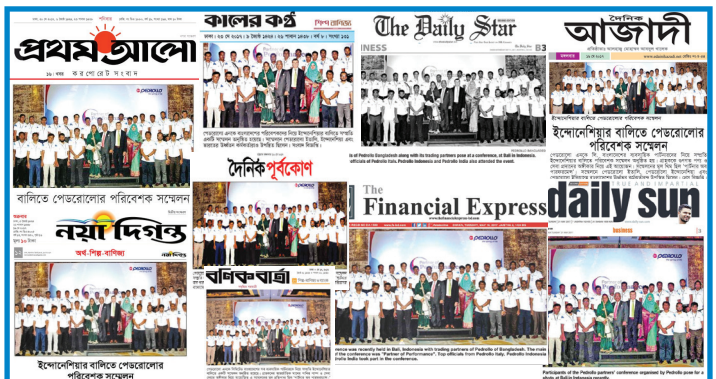
News Coverage of Pedrollo Distributor Conference in various media